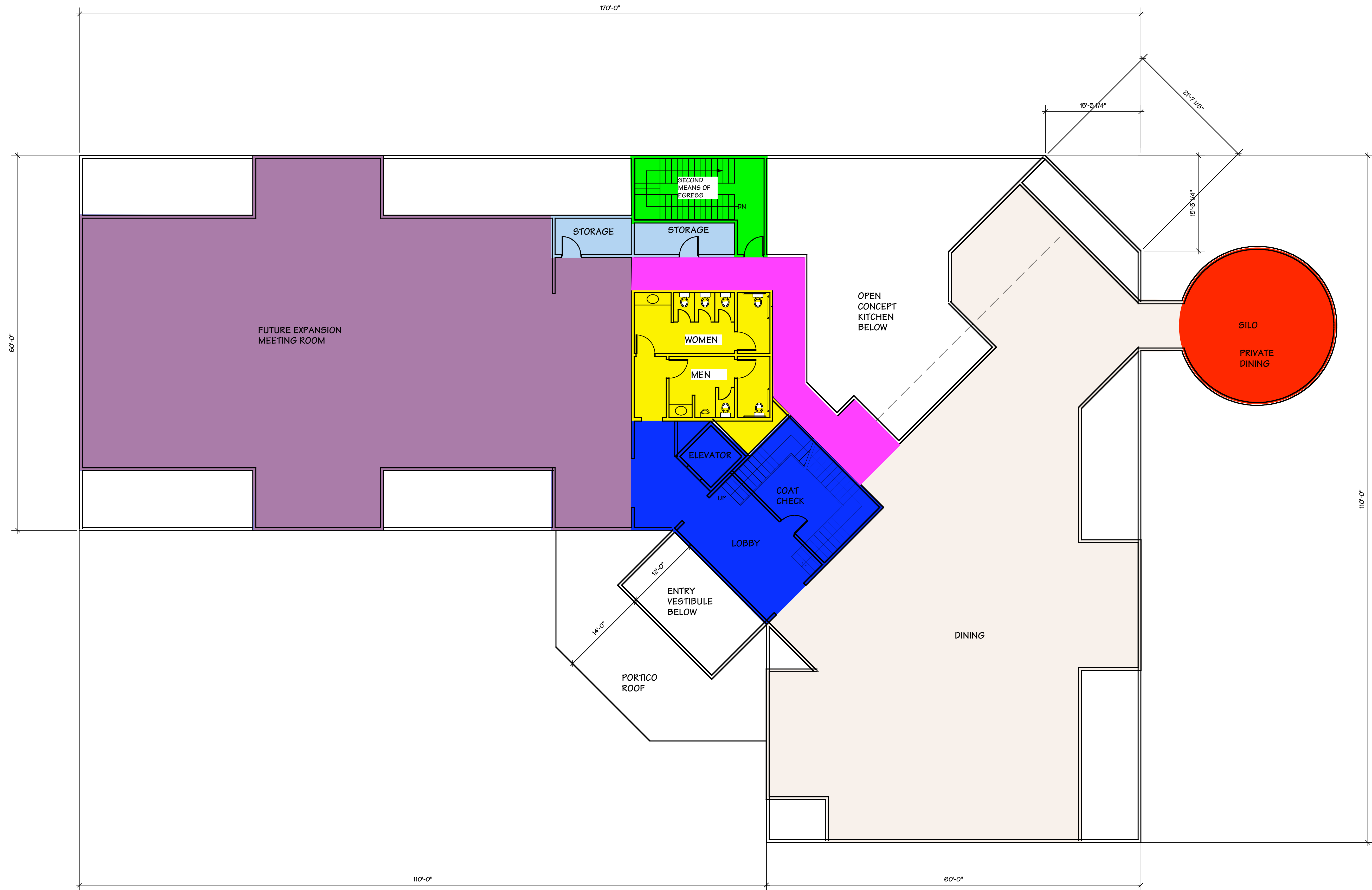
CONCEPTUAL SECOND FLOOR PLAN SCALE: 1/8" = 1'-0"