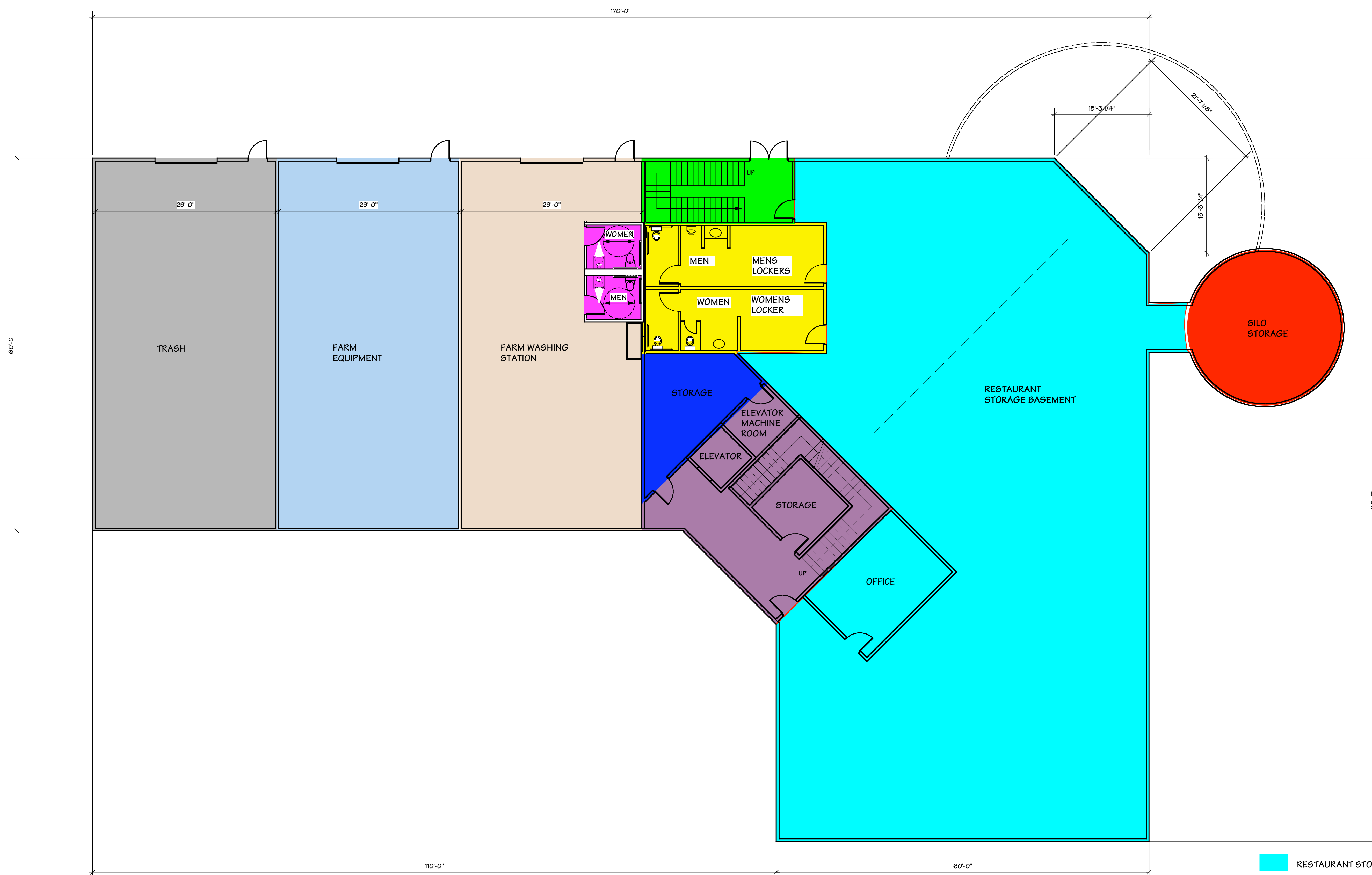
CONCEPTUAL BASEMENT FLOOR PLAN SCALE: 1/8" = 1'-0"