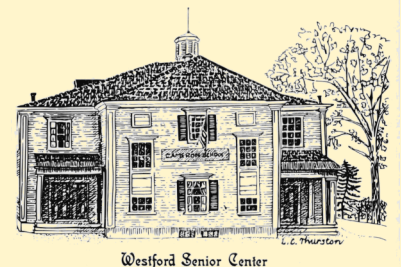
Westford Senior Center